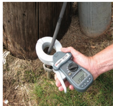
The DET14C is being used to test a pole ground.