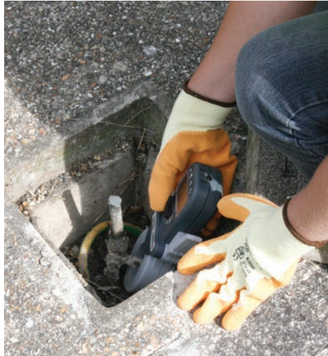
The DET14C is shown measuring a ground spike in a ground well.