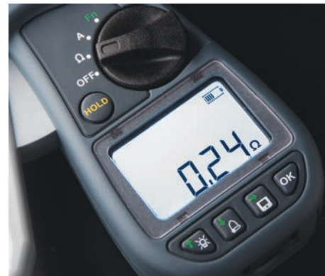
Close up of instrument's front panel.