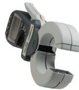
The clamp head of the DET14C/24C has a smooth mating surface and no interlocking teeth. Its large elliptical design improves access to the test specimen.